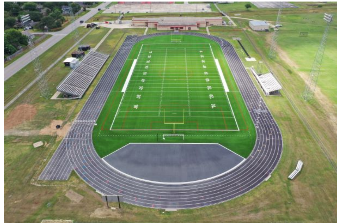
Terry High School